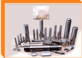
Special Purpose Hex Nuts, Bolts