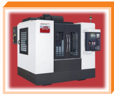
VMC Machine (ACE Micromatic) Size : X 650 mm Y 450 mm Z 500