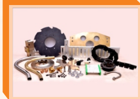
Precision Machined Parts