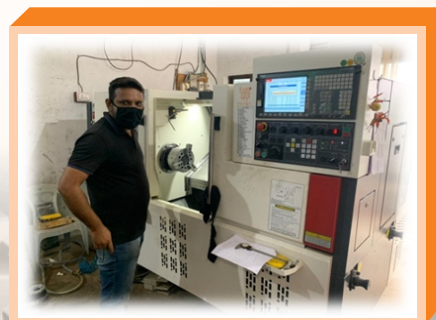
CNC Turning Centre (ACE Micromatic) Maximum Turning Dia 350 & 550 Lenth