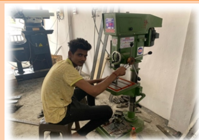
Drilling & Tapping Mchine