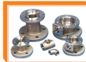
Precision Machined Components