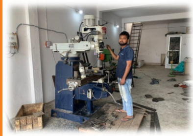
DRO Milling Area 1