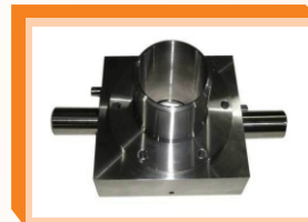
Precision Machined Parts