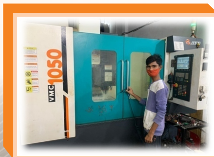
VMC Milling Machine Size : X 1050 mm Y 520 mm Z 500